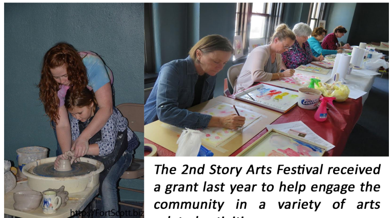
The 2nd Story Arts Festival received a grant last year to help engage the community in a variety of arts related activities

Grant applications were received in August 2016 from 17 different entities. The grant selection process is always a challenging but rewarding experience as there are so many deserving projects organized to benefit the Fort Scott area.