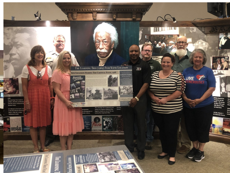
Delivery of Completed Learning Tree Film Tourism Trail Signs