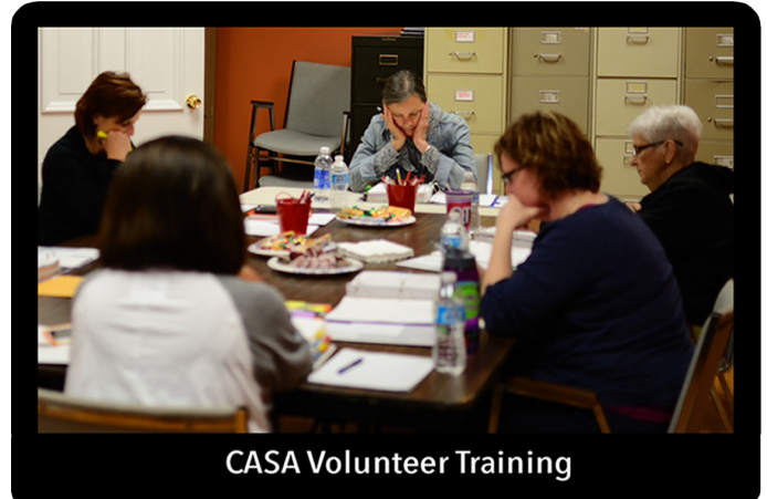
CASA Volunteer Training